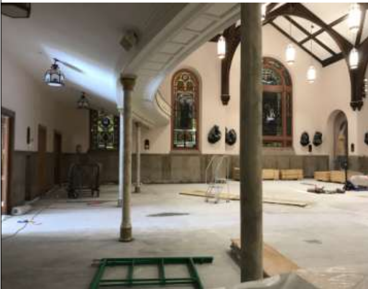
Finished concrete ready for tile to be installed.