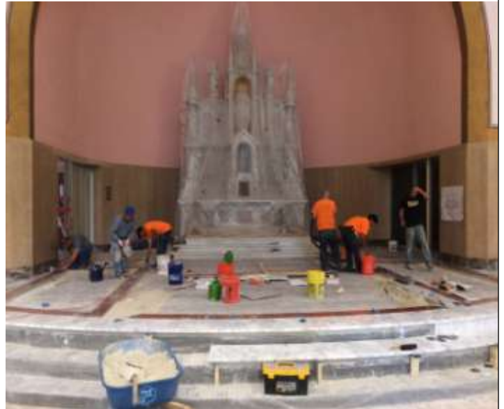
Progress being made around the Sanctuary and on the steps