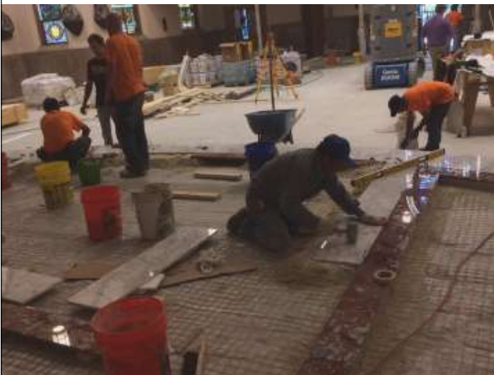
Marble tile being installed in the Sanctuary.